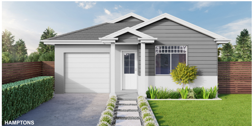
HAMPTONS Laila 15.4

CSB Homes foremost in quality since 1994 it's personal!