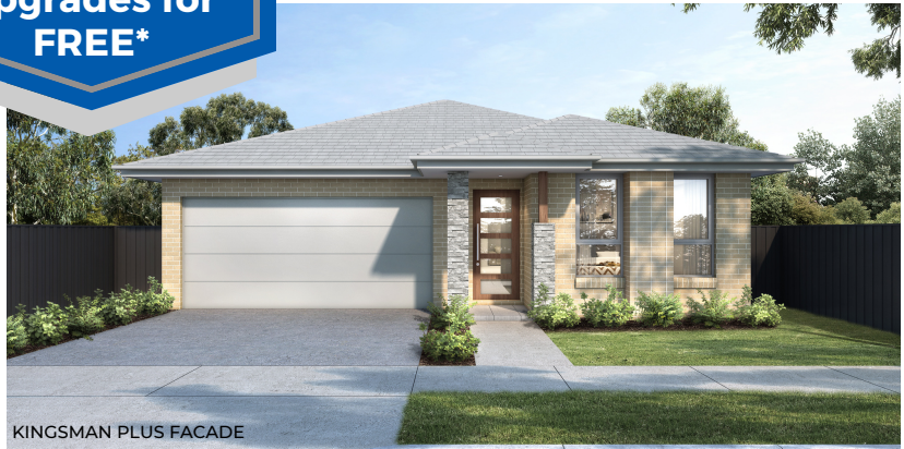
KINGSMAN PLUS FAÇADE