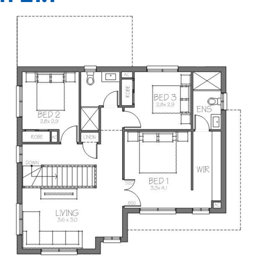
Façade priced on application