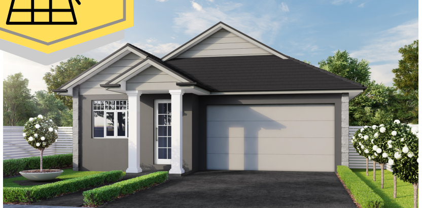
Facade priced on application

CSB Homes foremost in quality since 1994 it's personal!