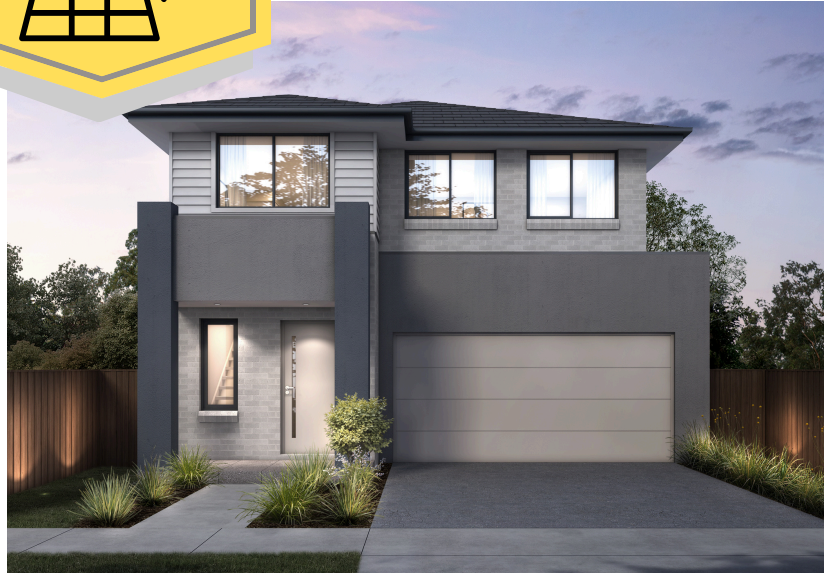
Darcy 22 MKII

CSB Homes foremost in quality since 1994 it's personal!