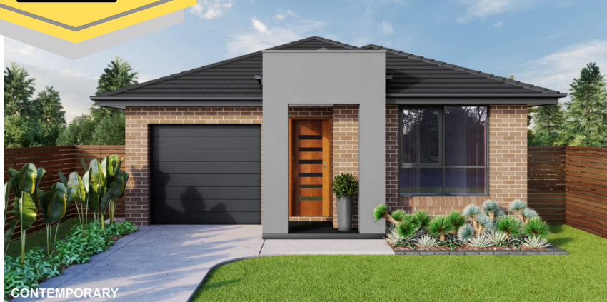
Alana 19.3 MKI

CSB Homes foremost in quality since 1994 it's personal!