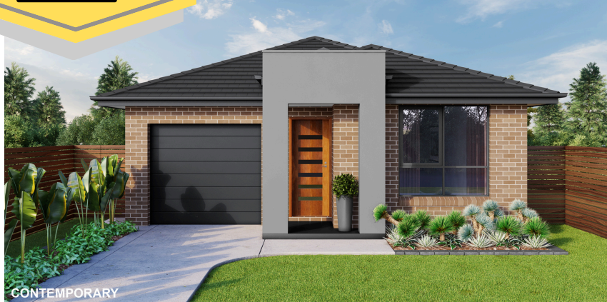
Alana 19.3 MKI

CSB Homes foremost in quality since 1994 it's personal!