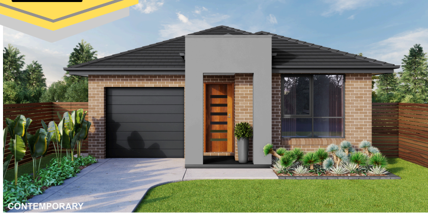
Alana 19.3 MKI

CSB Homes foremost in quality since 1994 it's personal!