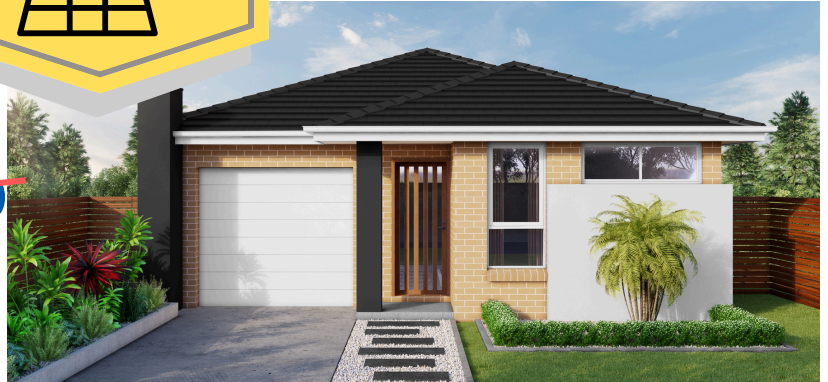
Alana 19.3 MKI