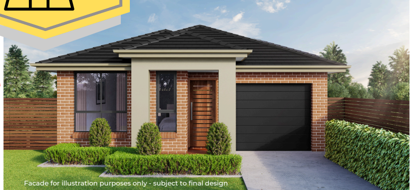
Facade for illustration purposes only - subject to final design

Lot 23 Wugan Road, AUSTRAL $1,068,880 $1,058,880**