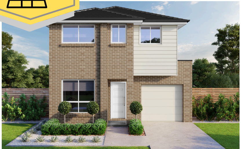
Custom Eva 21.47

CSB Homes foremost in quality since 1994 it's personal!