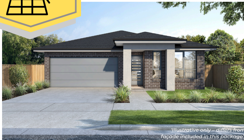
Custom Charlize 18SQ

CSB Homes foremost in quality since 1994 it's personal!